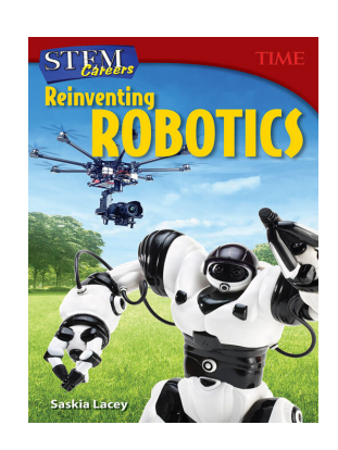
STEM Careers: Reinventing Robotics by Saskia Lacey