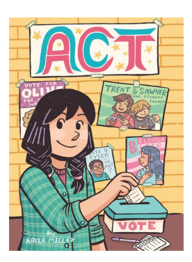
<u>Act</u> <u>by Kayla Miller</u>

<u>The Pull of the Stars</u> <u>by Emma Donoghue</u>