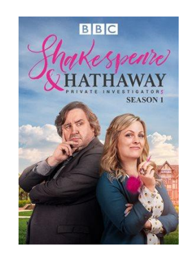
<u>Television:</u> <u>Shakespeare And</u> <u>Hathaway</u>