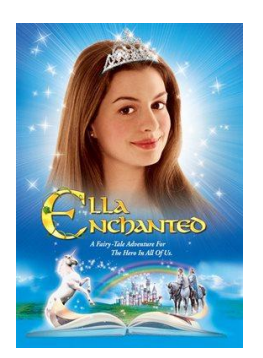
<u>Kids:</u> Ella Enchanted