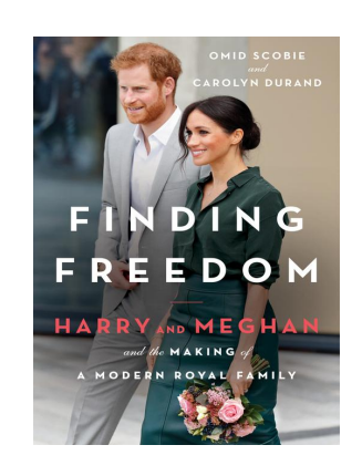
Finding Freedom by Omid Scobie